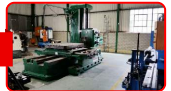
LINE BORING MACHINE