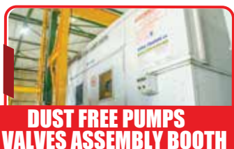
DUST FREE PUMPS & VALVES ASSEMBLY BOOTH