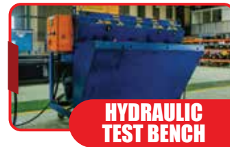
HYDRAULIC TEST BENCH