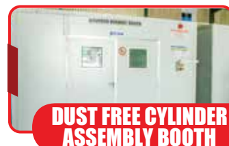
DUST FREE CYLINDER ASSEMBLY BOOTH