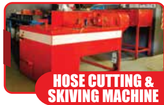
HOSE CUTTING & SKIVING MACHINE