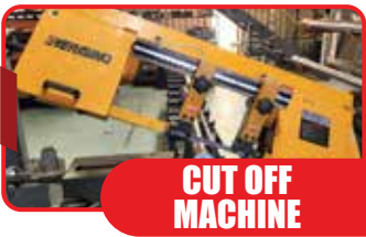
CUT OFF MACHINE