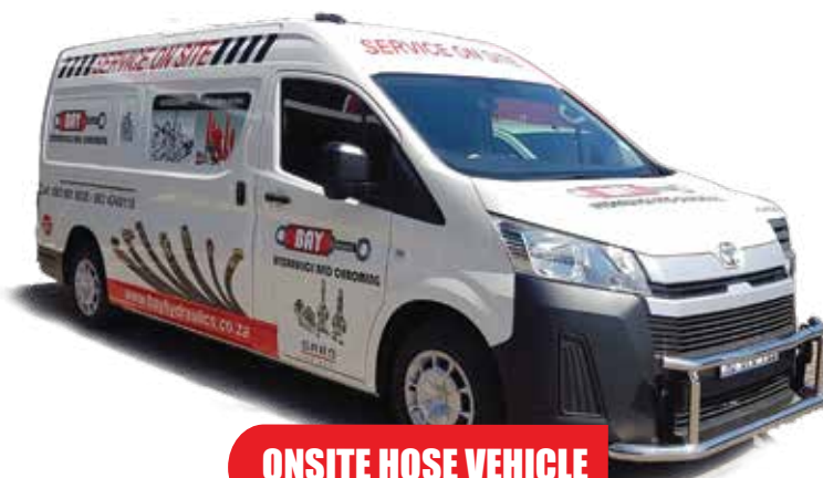
ONSITE HOSE VEHICLE