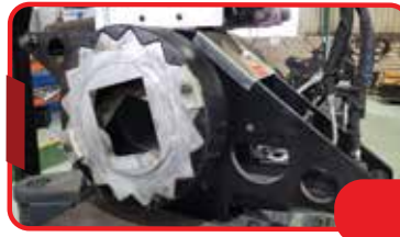
Cylinder Stripping, Assembling, Testing, Nut Cracker And Torque Tightening Of Piston