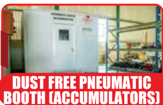
DUST FREE PNEUMATIC BOOTH (ACCUMULATORS)