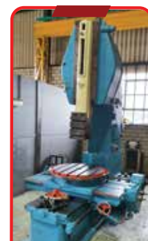
LINE BORE MACHINE